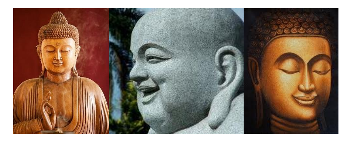
Freeing the Awakened Heart